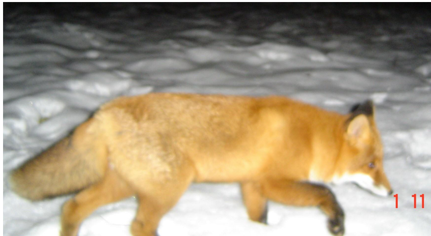
Peditionkettu noteerattiin useana yönä kiertelemässä lem-mökkiä.

Yöllä pari rupubressaria valvotutti (mm. 760 Uirapuru, 1360 Bandeirantes), mutta vaikka tuhinoita kuunneltiin koko yö kunnon nousua mihinkään suuntaan ei tullut. Aamu (0500-) toi kuuluviin jo muutaman jengin, mutta ei vielä raporttiin asti. Myöhemmin aamulla muutama IB-asema kuului, uutena RNE-5 Castilla Mancha 1314. Aasia avautui 1150 alkaen muutaman Thain noustessa (mm. 1557 RT Trad, Thahaan Akartit 945 ja 1224). Loppupäivä olikin sitten pelkkää intiakuuntelua, helminä Vijaywada 837, Jalgaon 963, Sangli 1251 ja Mathura 1584. Jalgaon kuului ilman tietoakaan YLE:stä, lievänä vaivana vain Xinjiang PBS. Komeiden Jalgoanin lokaalidien mennessä purkkiin 1600 tunti DX-kuuntelullista riemua, taas oli mahdottomalta tuntunut muuttunut todeksi. Thai asemien yönousu alkoi jo 1945 (1296 Kasetsart) ja 2100 noteerattiin 1197 Jor Thor Lor Lopburista sekä useampikin unideiksi jäänyt.